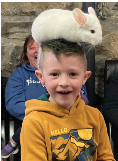
A chinchilla keeps your head warm!