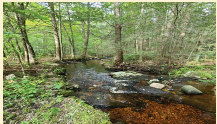
Rugg Brook, Winchester

Email: winchesterlandtrust@yahoo.com or look for updates on WLT's Facebook page.