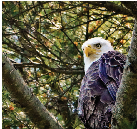
Bald Eagles, like the one pictured, nest at WLT's "Long Pond Ridge" property.

Townpeople of Winchester have probably noticed Bald Eagles nesting and fishing on Highland Lake, Crystal Lake, and Park Pond. A total of five Bald Eagles were spotted wintering on Highland Lake in February - two adult females, one adult male, and two immature females spent their winter months enjoying our town's largest body of water. With spring comes breeding, and a nesting pair of adult eagles are known to defend a large radial territory when expecting young, forcing other eagles away from the area. The nesting eagles on Highland Lake have sadly been reported to have had damage to their nest, and are unlikely to fledge any eaglets this year, though they will continue to protect their territory including Highland and Crystal Lakes for the coming months. Park Pond is also home to one adult male eagle. In our neighboring towns, there are two nesting eagle pairs on Barkhamsted Reservoir, one pair at the American Legion Forest in Barkhamsted, and sightings of eagles on West Hill Pond in New Hartford.