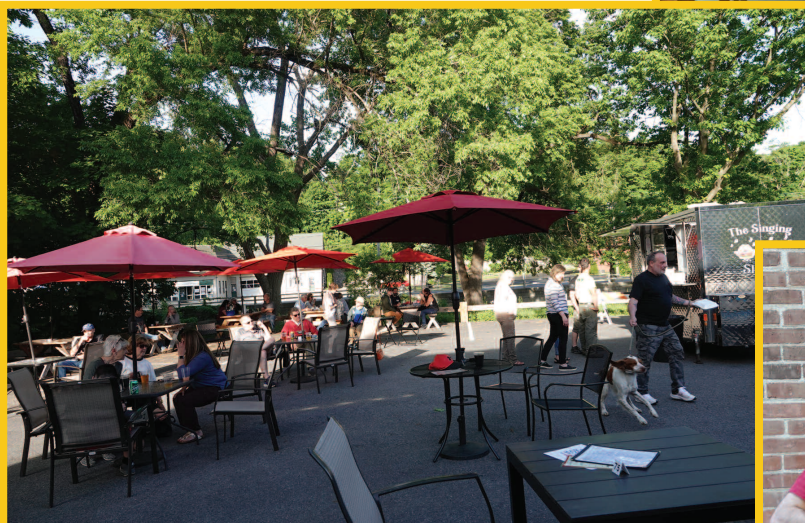
The weather and the turnout were perfect!