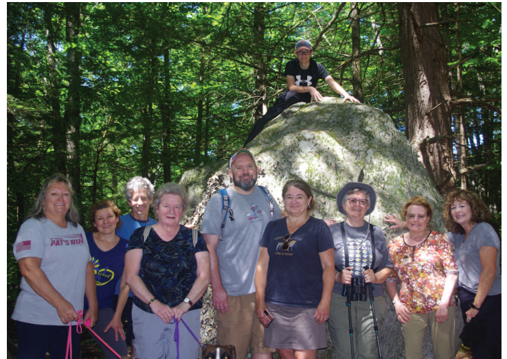
CT Trails Day, June 4, 2022. Hikers at the "Great Rock" on the Ruez Property.