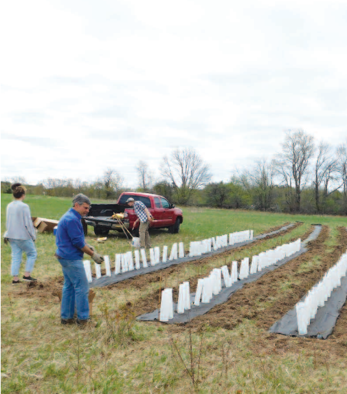
A few of the volunteers who helped plant chestnut seedlings in Hurlbut Field