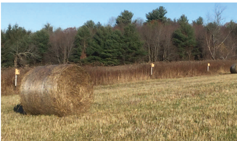
Eagle Scout candidate Connor Rego's "bluebird trail" installed at Hurlbut Field