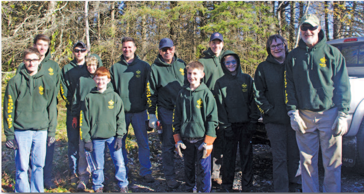
Winsted's Troop 127, ready to install benches at the Houlihan Woods/ Michael Giordano Tribute Area

The first 150 seedlings were planted this spring at Hurlbut Field, a WLT property in Winchester Center. Eventually an entire acre will be dedicated to this program.