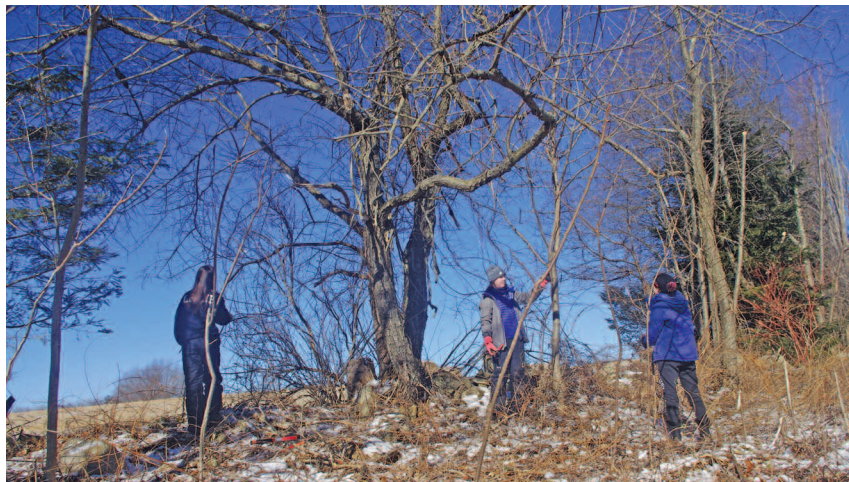
Student volunteers from Northwestern Regional #7 cutting bittersweet at Hurlbut Field