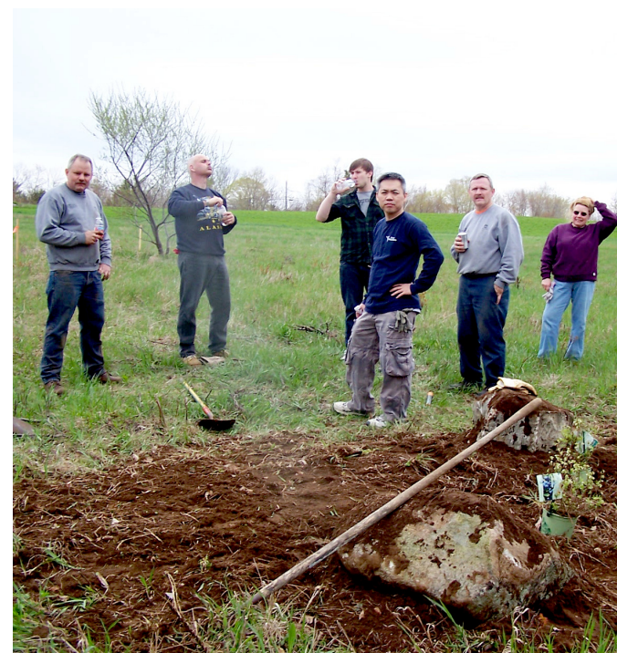
Hard-working ALCOA employees