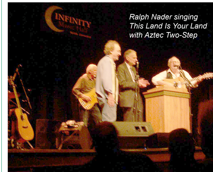
Ralph Nader singing This Land Is Your Land with Aztec Two-Step